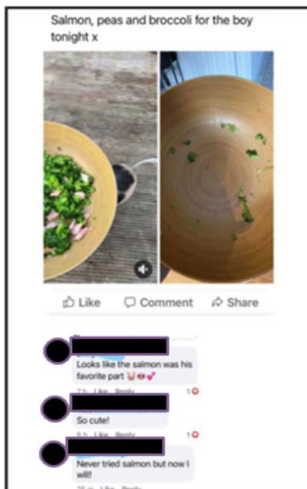
Facebook post about feeding household food to a pet pig