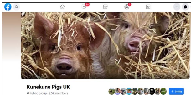
The Kunekune Society Facebook page

croft number. We got sent a booklet which was about caring for pigs and it talks about African Swine Flu. (Keeper 7)