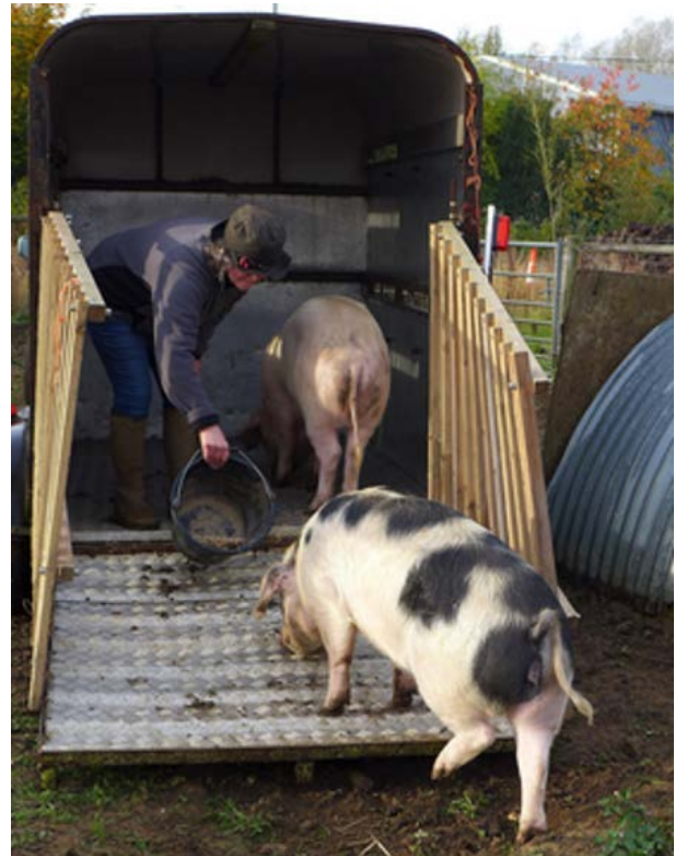
Loading pigs

Because of the regulations around slaughtering at home, particularly those around the sale of home slaughtered meat, none of the participants killed their own pigs, though some had the necessary