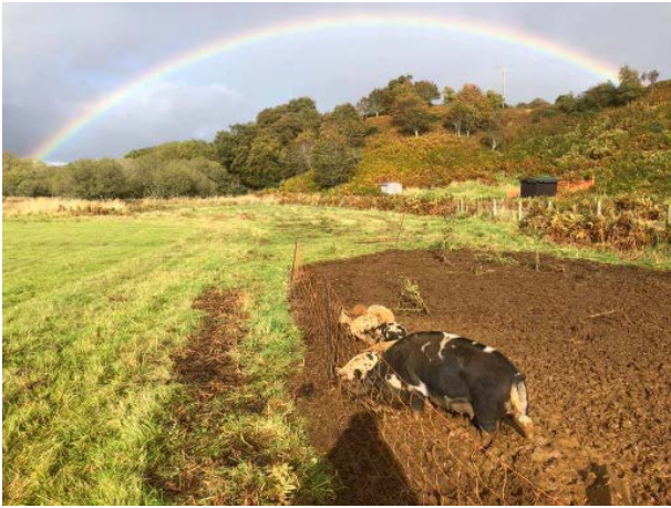
Pigs can be used to clear land

...it's not about making money as such but actually providing people with good quality food you know. I mean we probably do make a bit but it's not mega mega bucks you know. It pays for itself but only just. (Keeper 2)