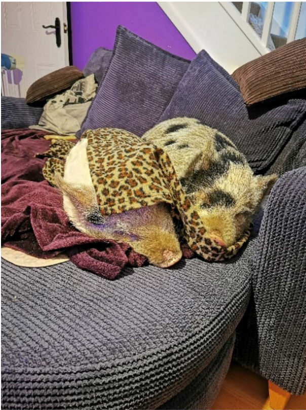
Pet pigs at home on the sofa

a lack of understanding of pig behaviour and good welfare and there may be an issue of carcass disposal in a suburban area.