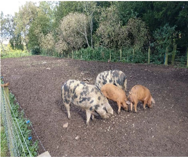
Pigs exhibiting natural foraging behaviours

daughters work for farm shops, so we get veg, but it doesn't come into the house and it hasn't been in anybody's house. So, we're lucky that way but no (Keeper 3)