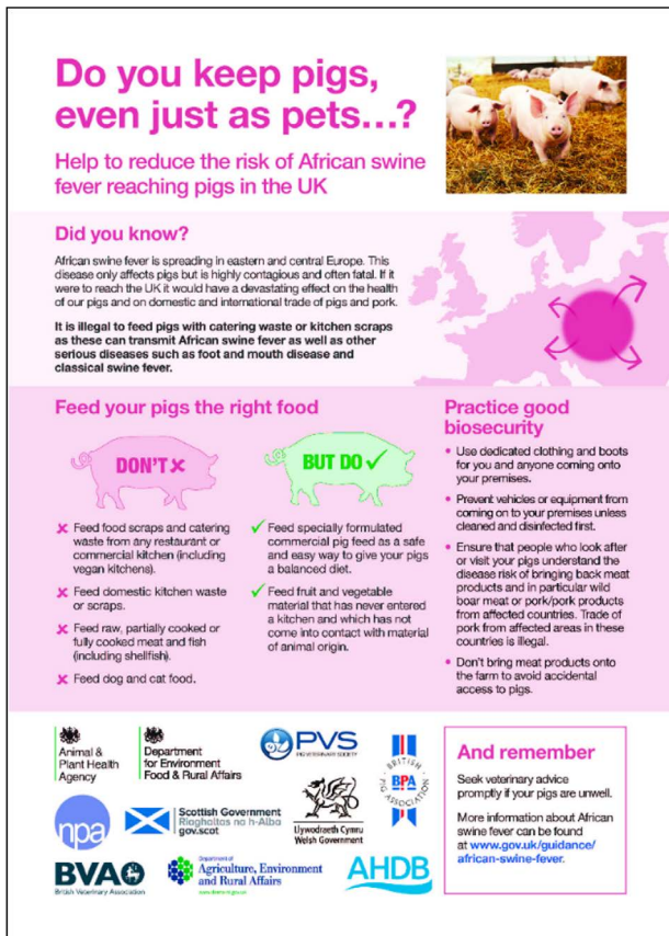
AHDB ASF poster