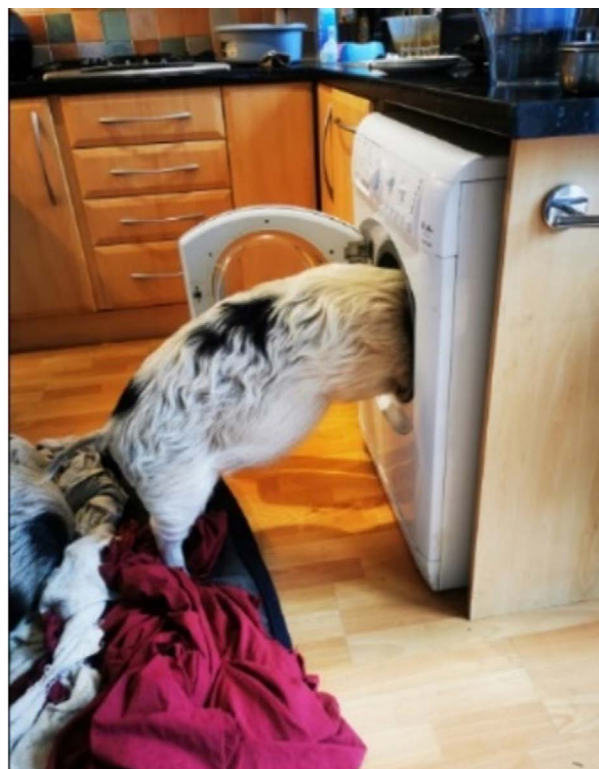
A pet pig exploring the tumble drier