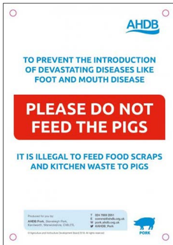
Sign available from the National Pig association

No! Oh no! No! Definitely not! It's so frowned upon. We've got...both my