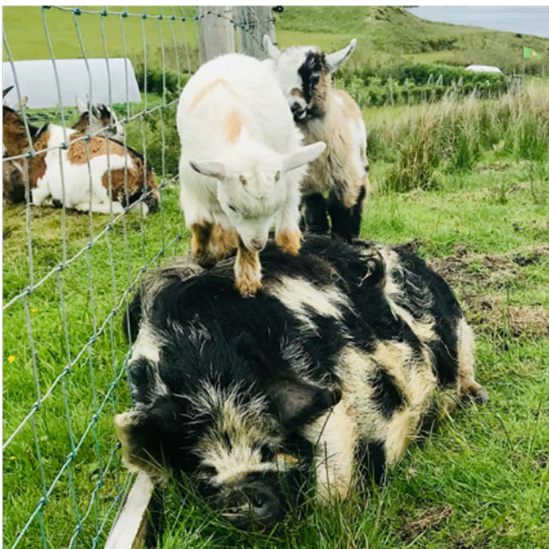
Pigs mix happily with other livestock

[We had] 12 meat boxes the last time out, the last lot of pigs and we didn't even get home and we'd delivered them all. We advertise them on Facebook and they just go like hot cakes. (Keeper 2)