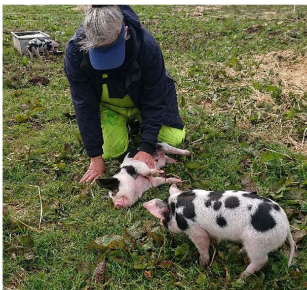
A smallholder's piglet enjoying a tummy rub

The smallholders and crofters interviewed have a good knowledge and understanding of the regulations around movement, feeding and biosecurity. When asked what their understanding of biosecurity was, they gave knowledgeable answers about cleaning facilities and trailers, disinfecting footwear, changing clothes when leaving the holding and generally not being in contact with livestock from other holdings. Due to the nature of their premises, mainly rural and often off the 'beaten track,' the participants reported very little interaction with other pig keepers or stock other than their own. Smallholders that breed pigs tend to have a permanent cohort of sows and a boar on site. The offspring either leave the holding to go directly to the abattoir or are sold to other smallholders as breeding stock or for fattening by them before slaughter.