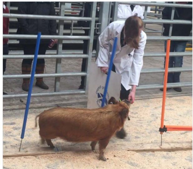
Showing a pig at a smallholder festival

Some participants mentioned family or friends that would take care of pigs while they were away, but