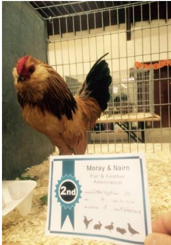
Show bird: Source, Carol Kyle

while others felt they were doing a good deed by rescuing ex battery hens. Opportunity to show birds also had appeal. Everyone said they 'just enjoyed having the birds around'.