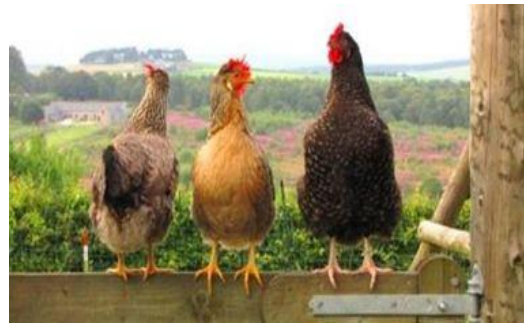
Free range hens

Yeah well they live outside – you know, they're always going to... So yeah it is potentially a problem even if we're not moving birds around. But there's nothing you can do about it, you know – it's one of these things that's gonna happen or it's not. But you can just do what you can...to prevent it (R3)