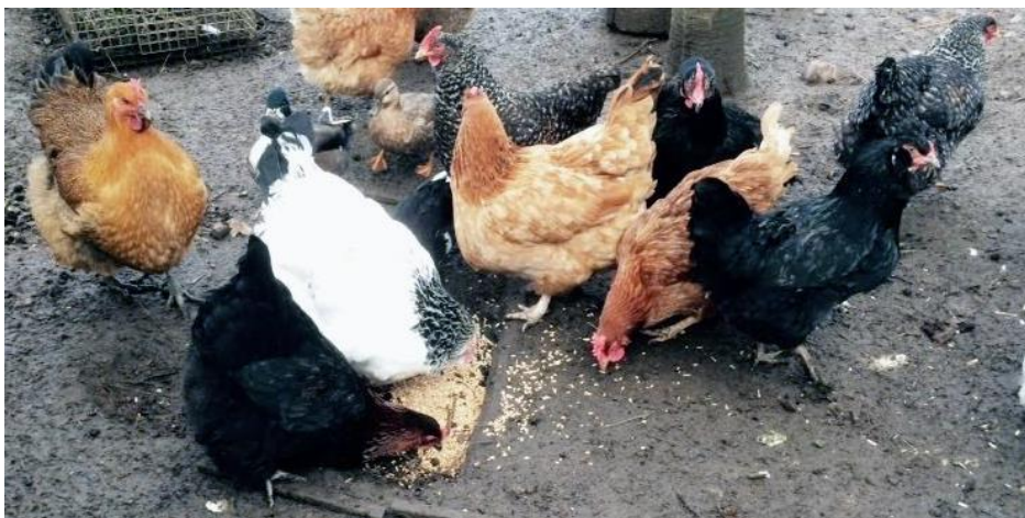
Poultry coping with confined conditions

I'm just glad the weather has been fairly good; their run is in such a mess (FB)