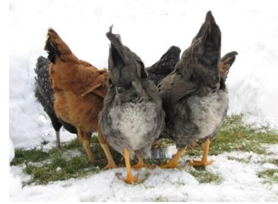
Hens enjoying a tasty treat: Source, Anne Taylor

In general participants went to great lengths to supply a varied diet including one person who cooked and pureed vegetables to make them easier to eat.