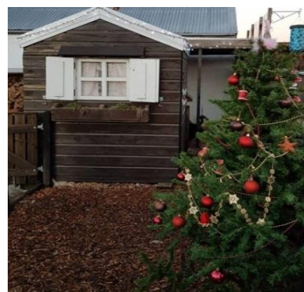
Poultry palace: Source, Anon.

In general, the number and variety of poultry reflected the location of the flock – urban flocks tended to be smaller in number, and limited to a single species (typically chickens). Rural properties tended to have larger and more varied flocks. Size of holdings ranged considerably from a couple of hutches housing bantams in a back yard to over 10 acres where poultry ranged freely. Commercial farmers who also had poultry have considerably larger acreages, but restricted their birds to coops or smaller fenced off areas. The standard of poultry housing among keepers varied considerably from fairly rough 'Heath Robinson' style shelters to beautifully built personalised chicken houses complete with curtains.