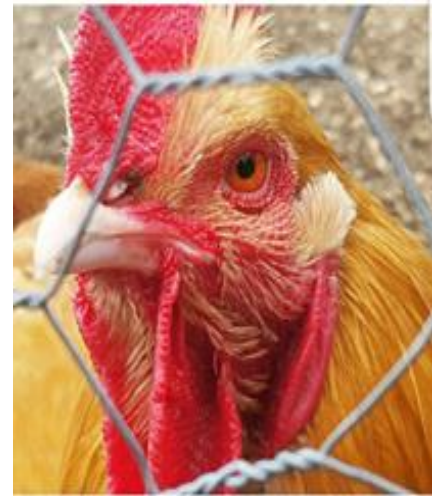
Bird in 'lockdown': Source, Anon.

I was trying to work out the logic behind the policy of keeping poultry indoors for 30 days. I'm aware it's because of a specific strain of bird flu, but what is the ban attempting to do? The flu is being spread by wild birds migrating, so if a flu carrier comes here then it could spread to our wild birds, those catching it will probably die. Now for someone with around 1 to 50 birds this will if caught, mean their birds will die off, or need put down. Why is this a huge concern to Defra & Scottish Government? If your birds do get this flu then the likelihood of them spreading it further are minimal unless you sell them. Are they worried that this flu has the potential to migrate to humans? If so then the biggest threat is from migratory participants. The only method I see fit is a restriction on moving poultry. Can anyone enlighten me? (FB)